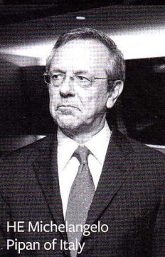
HE Michelangelo Pipan of Italy